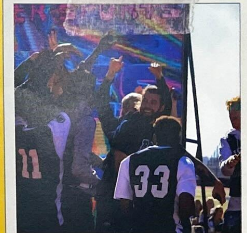
Winter Sports Rally